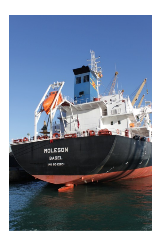
Under the ship's name and homeport on the stern, today you have also the IMO-number