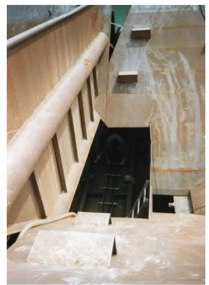
Nearing completion, one of the cargo hoppers and one of the hatches to the conveyor belt below