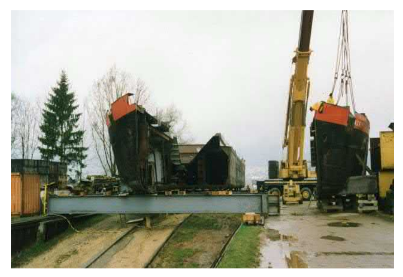
Construction yard in Arch. The fore ship is being assembled