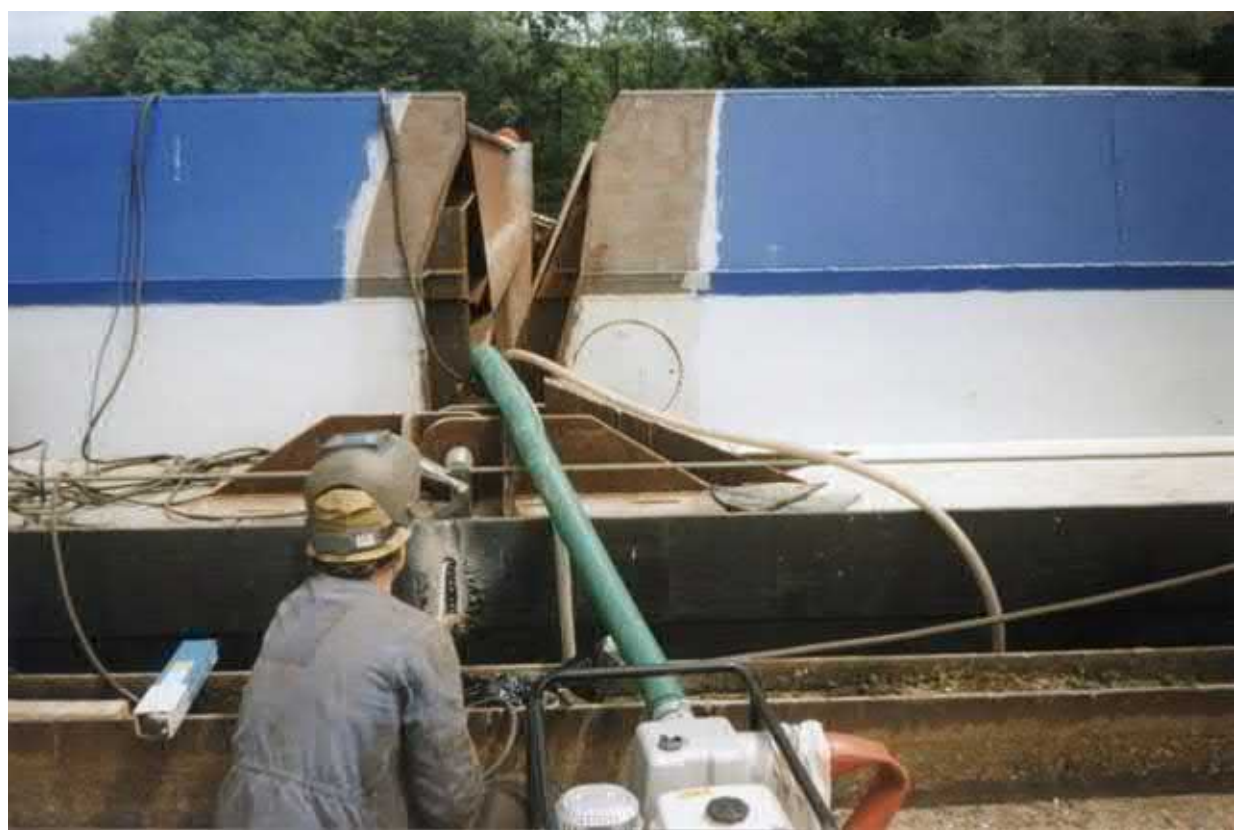
Welding in progress. Note from the interior water has to be pumped-off constantly