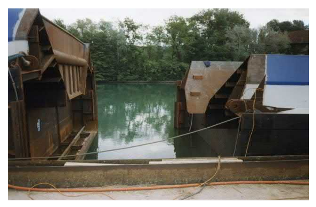
The joints of the two sections, but not jet aligned for joining