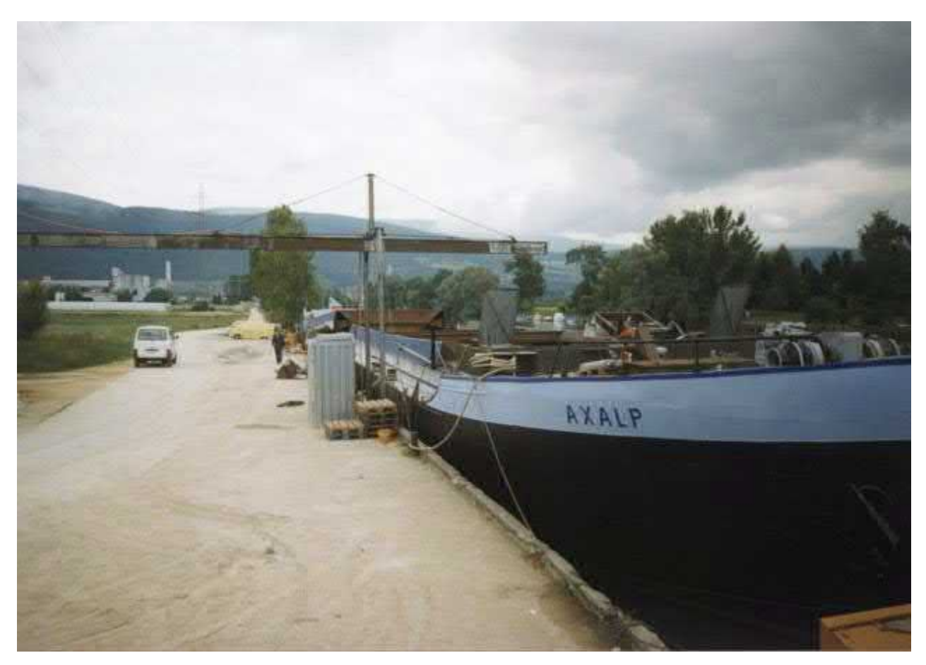
In the Zihl Canal at Thielle, ready to join the fore ship and the stern part