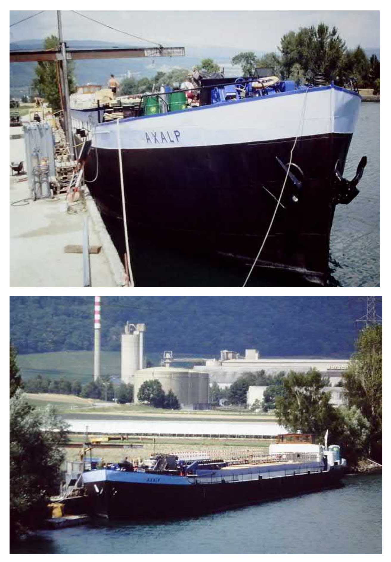
AXALP in Thielle on August 20, 1998, in the background the cement factory Juracim at Cornaux