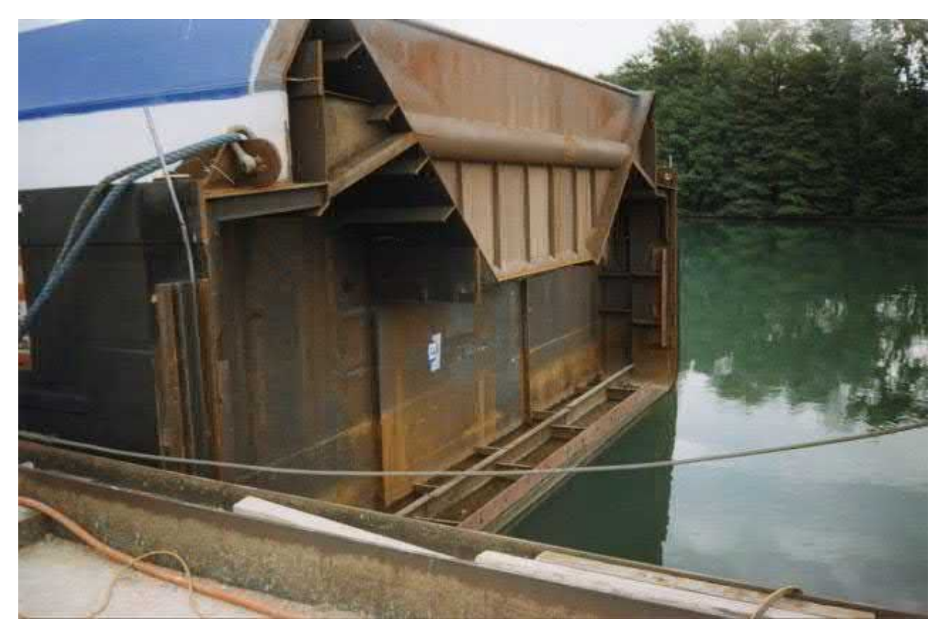
One of the sections, note the conveyor belt tunnel is temporarily closed-up with a steel plate