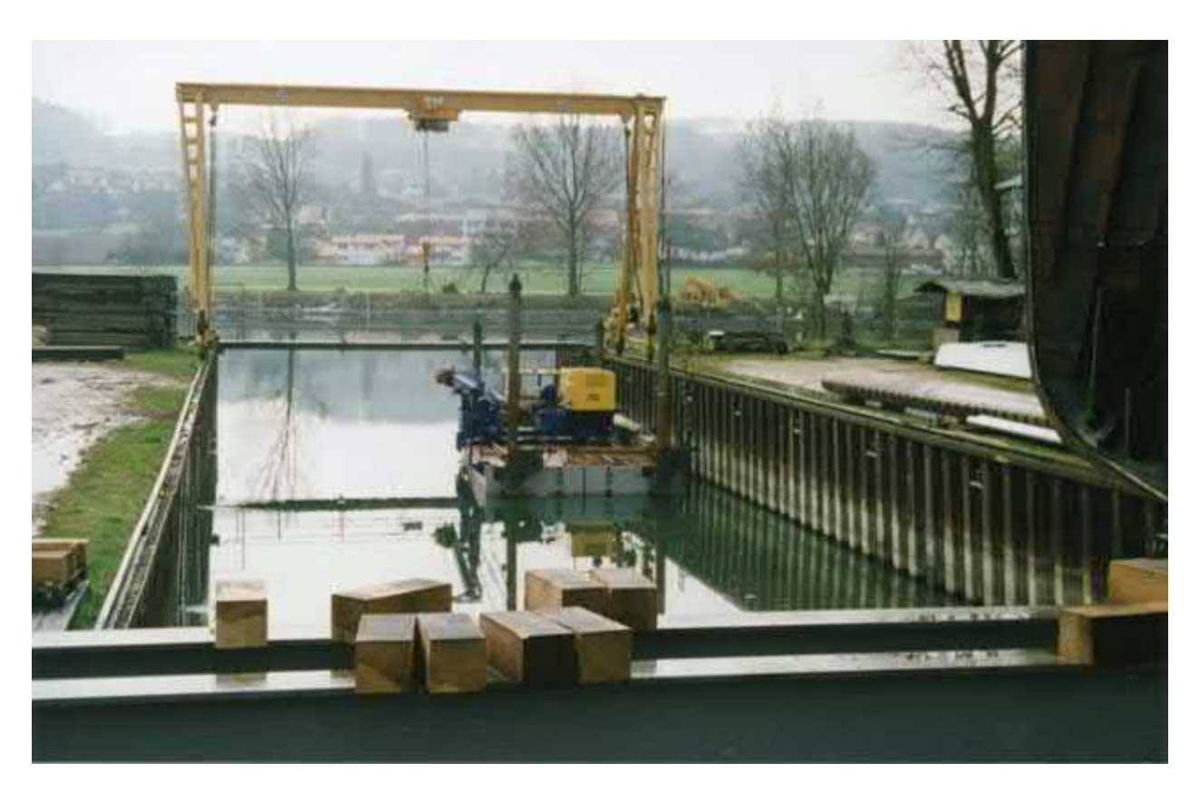
The launching place in the construction yard at Arch